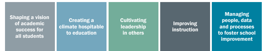
Five Key Practices of Wallace Foundation Principal Pipeline Initiative PLCs